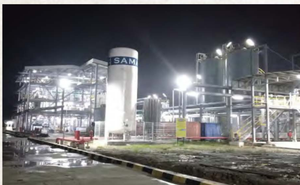
Green Surfactant Plant