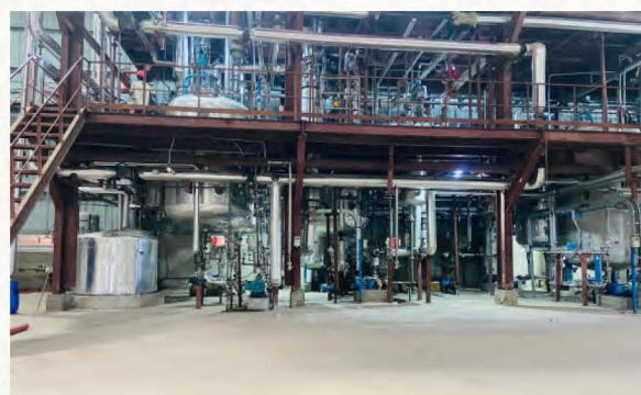
Modular Plant For Speciality Chemicals