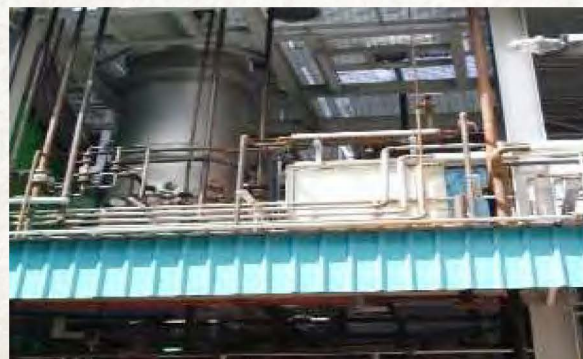
Fixed Bed Hydrogenation System