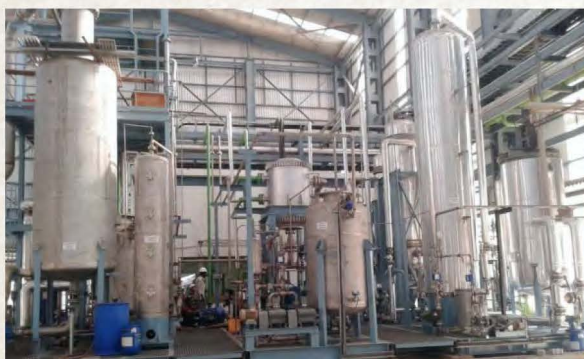
Skid Mounted Sulf(on)ation plant