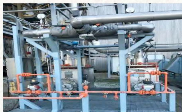
Ammonia Dosing System For NOx/SPM Control