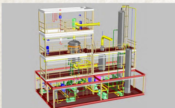
Customized Modular Plant