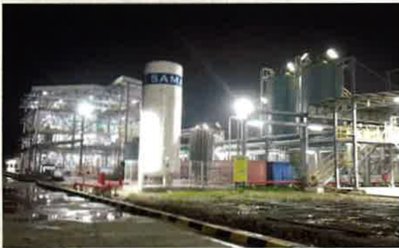
Green Surfactant Plant