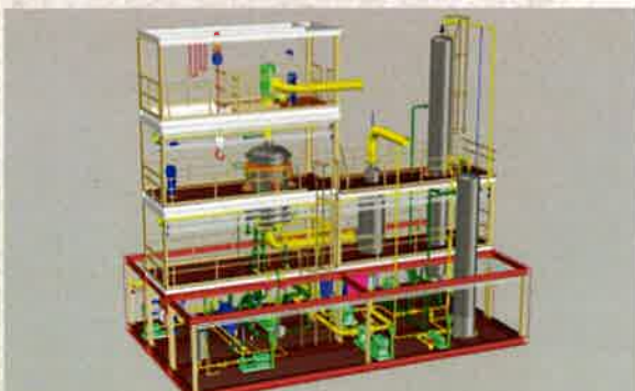
Customized Modular Plant