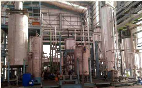
Skid Mounted Sulf(on)ation plant