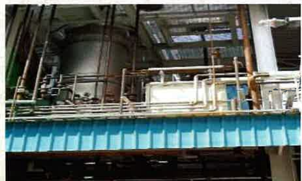
Fixed Bed Hydrogenation System