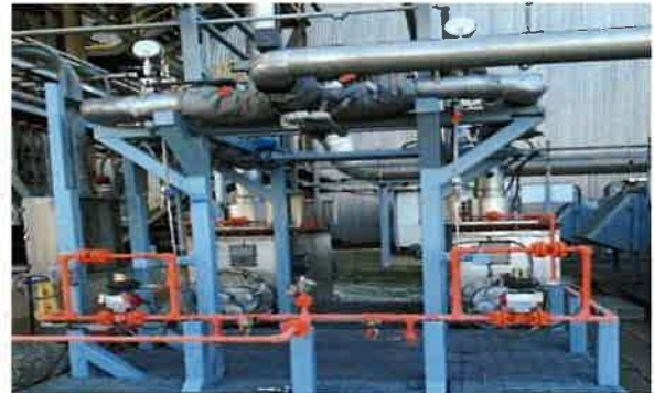
Ammonia Dosing System For NOx/SPM Control