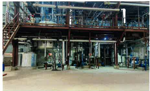
Modular Plant For Speciality Chemicals